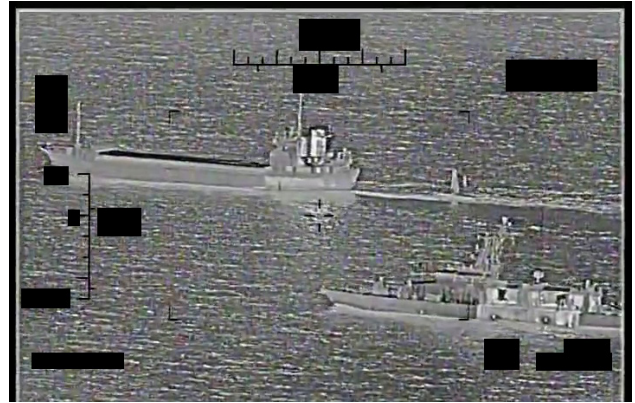
Photos of illegal towing of Sairdron Explorer.