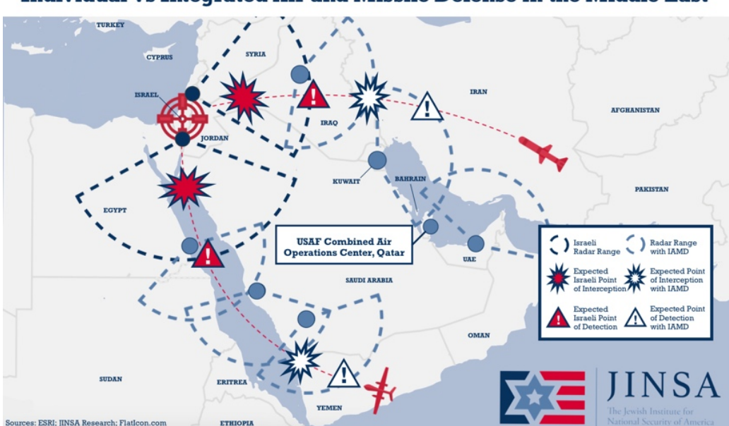
Individual vs Integrated Air and Missile Defense in the Middle East

In terms of building out the IAMD architecture, the assets that the United States, Israel, and other regional partners used to thwart the Iranian regime's attack demonstrated that there are already advanced U.S.-supplied platforms in the region.